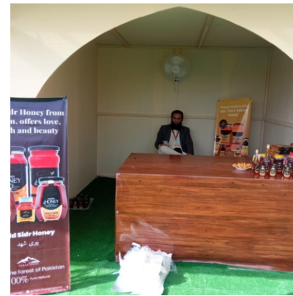
NARAN FOODS (PVT) LTD